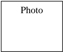
TABLE 5: CURRICULUM VITAE